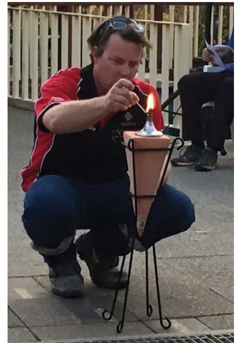
Above: Lighting the miners flame to signify the opening of the festival - photo provided courtesy of the Kalgoorlie Miner.

"It's a great day out for families with plenty of activities for the kids – and we look forward to continuing involvement with the festival in the years to come," added Helen.