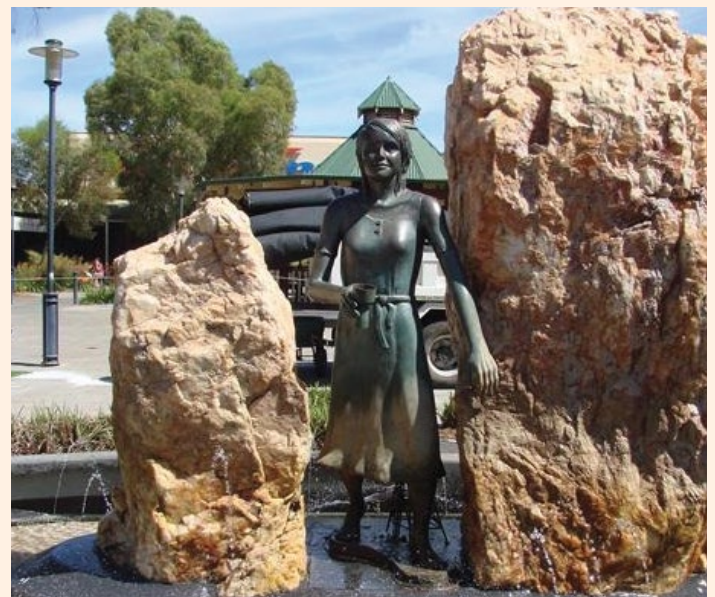
Above: Saint Barbara's Square statue

Saint Barbara was cruelly tortured, but miraculously her wounds healed, and on the way to her execution, she was said to have prayed for the lives of the miners who had shielded her from harm, rather than for her own life.