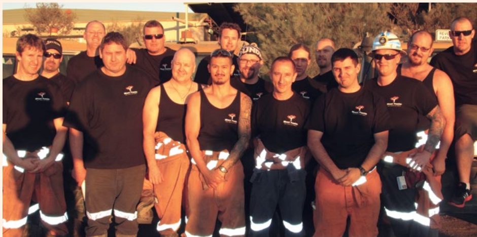
Left - Some of the Cliffs Nickel crew showcasing the new co-branded t-shirt.

The fundraising activity was so successful that the team at Cliffs Nickel have vowed to make this an annual initiative supporting Miners' Promise, and will be turning the design of the Cliffs Nickel logo into an onsite competition.