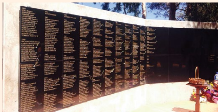
Above: The Miner's Memorial Wall in Kalgoorlie.

She was discovered by pagan shepherds when foraging for supplies out in the open. The shepherds betrayed her to her father, who re-captured her and ordered her torture and execution.